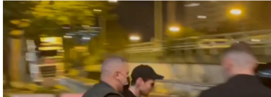
READ MORE: WATCH Durov walk out of French court

He was ordered to remain in France until the investigation against him concludes, and to report to a police station twice a week.