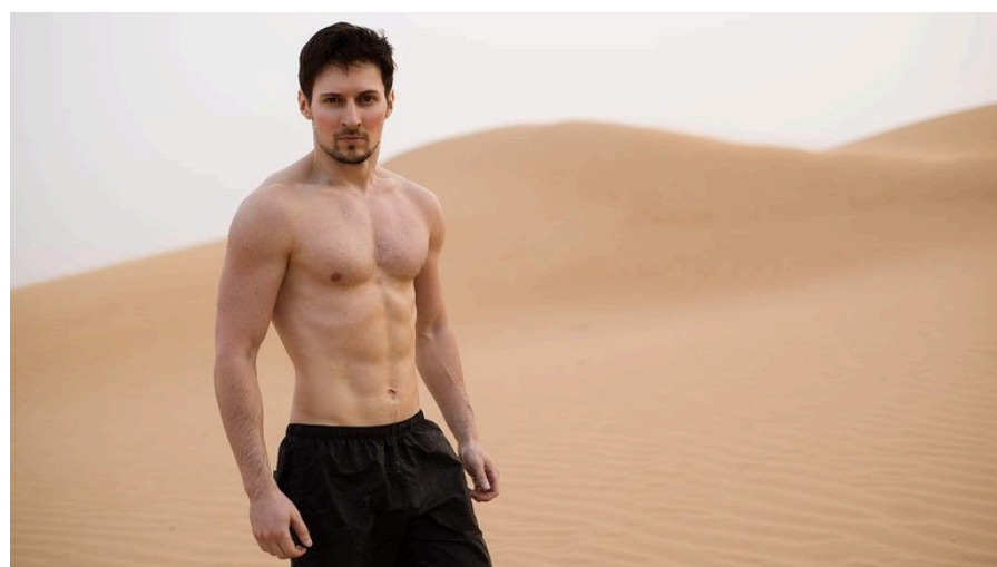
Pavel Durov posted on Instagram.com

A French court has accused the Russian billionaire of a dozen offenses, including facilitating illegal transactions