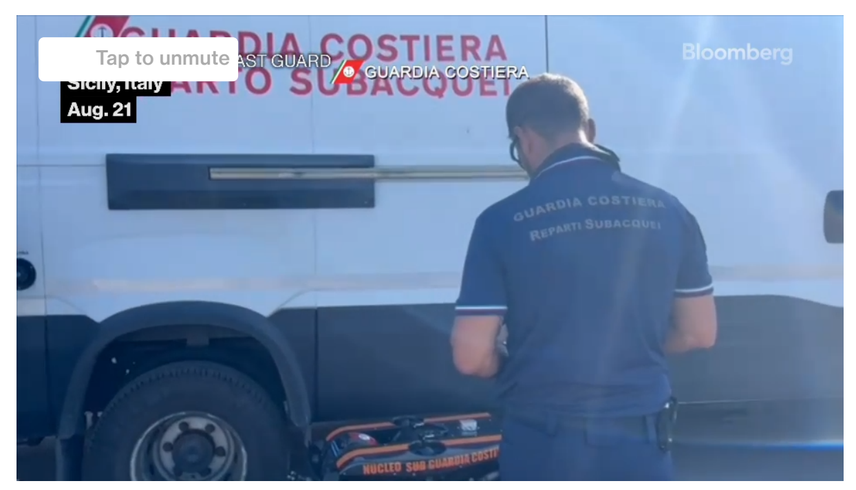
WATCH: A remote controlled underwater vehicle has been deployed at the site of the sunken superyacht.