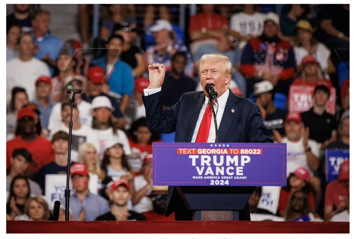
Former US President Donald Trump

"I think most people who are illegal immigrants are actually good, but you can't tell a difference unless there's a solid vetting of who comes across the border," said Musk, who was born in South Africa and described himself as a "legal immigrant."