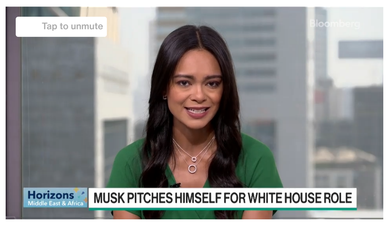
WATCH: Elon Musk pitched a role for himself should Donald Trump win a second White House term. Lizzy Burden and Bill Faries report.