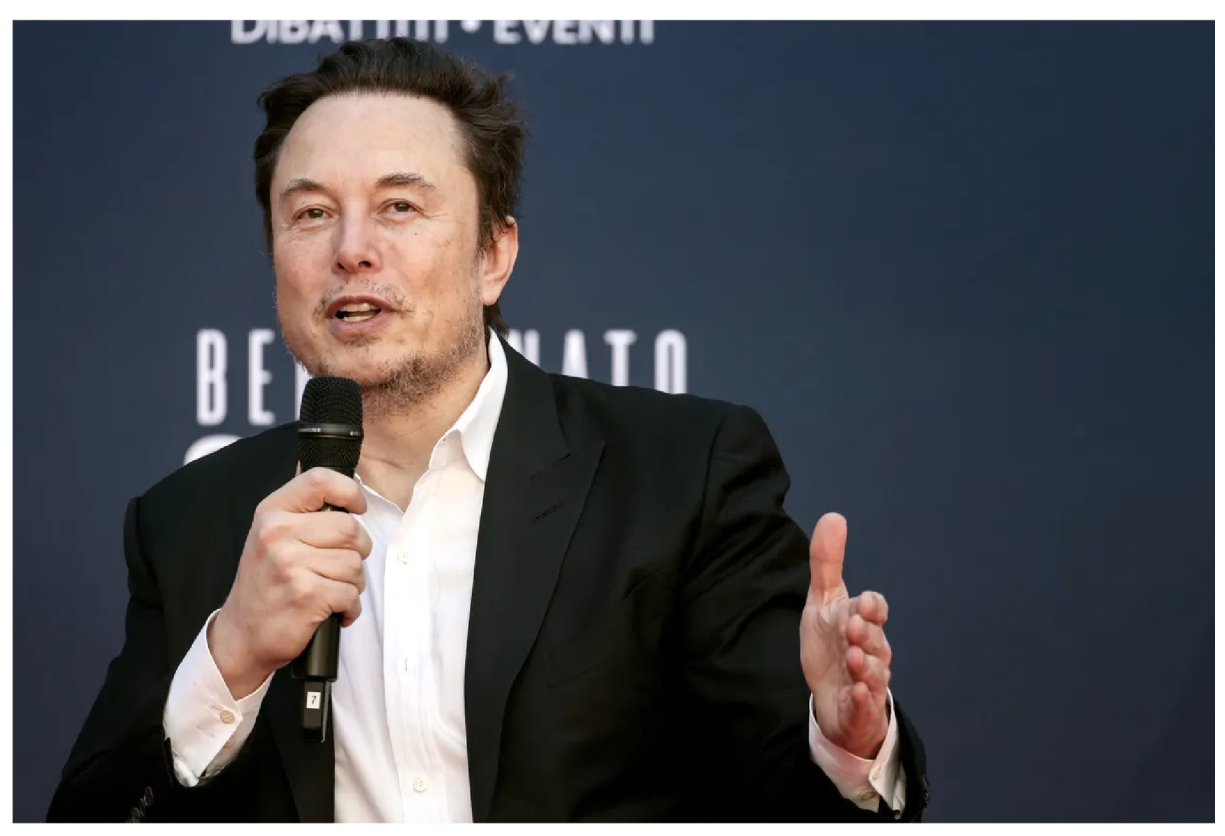
Elon Musk

right-leaning causes and candidates to make his mark on the political scene. He also created a super political action committee to support Trump's reelection effort.