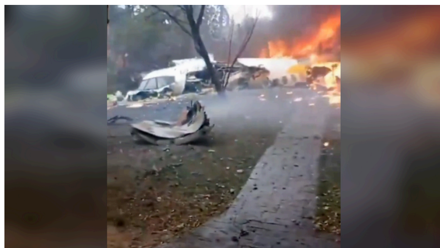
A still from a video purportedly showing the wreckage of an ATR-72 aircraft in Vinhedo, Brazil, August 9, 2024

The passenger jet fell from an altitude of five kilometers, smashing to pieces when it hit a residential area near Sao Paulo