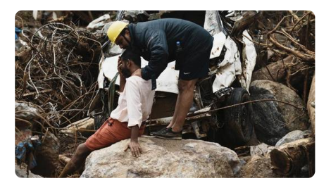
Decomposing Dead: 154 unclaimed body parts

'I'm afraid of dying': How and why Ukrainian men hide from military service FEATURE