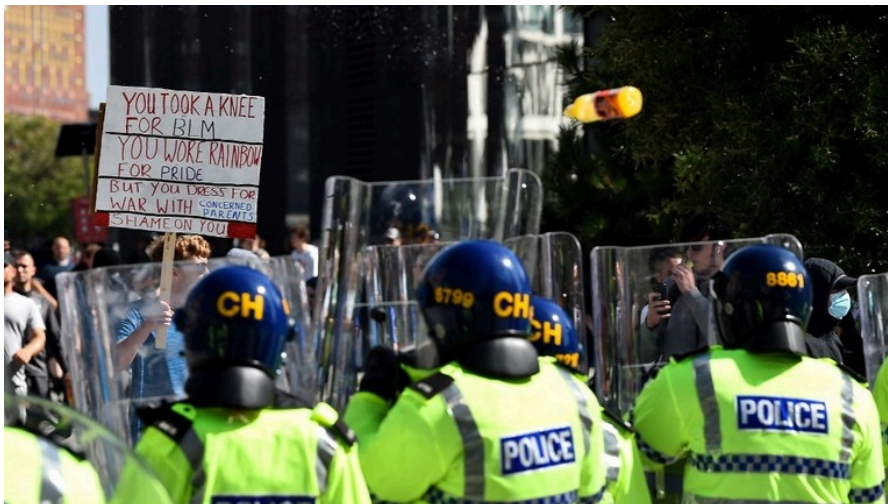
A bottle is thrown towards police officers in Liverpool, England, August 3, 2024

Protesters clashed with police and left-wing demonstrators in Manchester, Liverpool, and dozens of other towns and cities