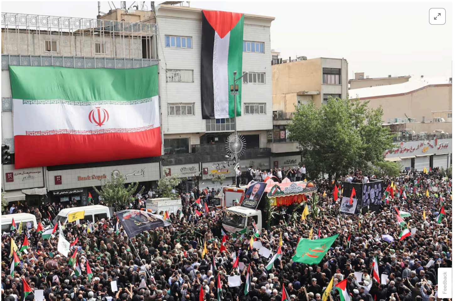
[1/5] Iranians attend the funeral procession of assassinated Hamas chief, Ismail Haniyeh in Tehran, Iran, August 1, 2024.