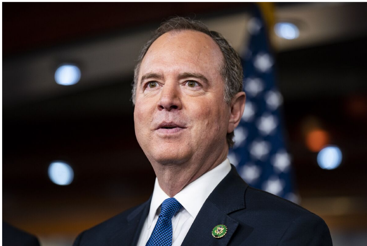
Representative Adam Schiff