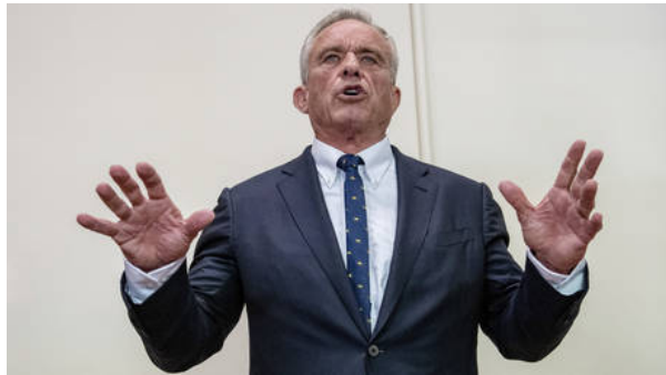
US 2024 Presidential candidate Robert F. Kennedy

"Biden has lost his way," Kennedy tweeted on Friday, arguing that the president should focus on America's domestic problems instead of trying to achieve "global