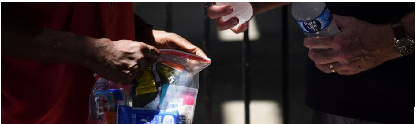
[1/4] A member of Star of Hope, a charity organization, passes out water to homeless people during a period of hot weather in Houston, Texas, U.S. June 27, 2023.