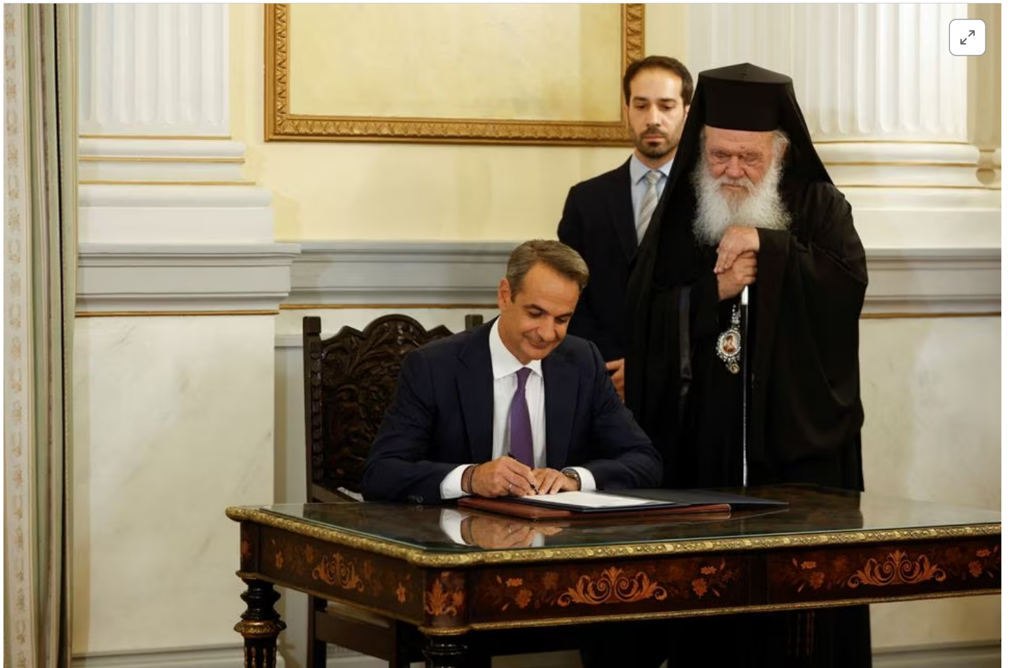
[1/10] Leader of New Democracy conservative party Kyriakos Mitsotakis attends the swearing-in ceremony, to become the new Greek Prime Minister, following a general election, at the Presidential Palace, in... Read more