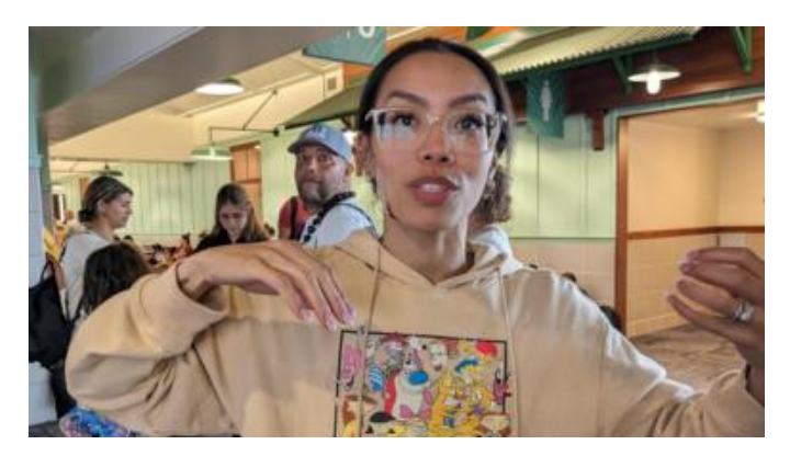
Skipping through fires: 'If I say jump, jump'