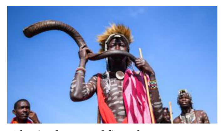
Blowing horns and fierce horsemen: Africa's top shots