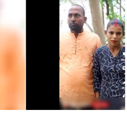
The new 'dangerous' trend of staged videos in India