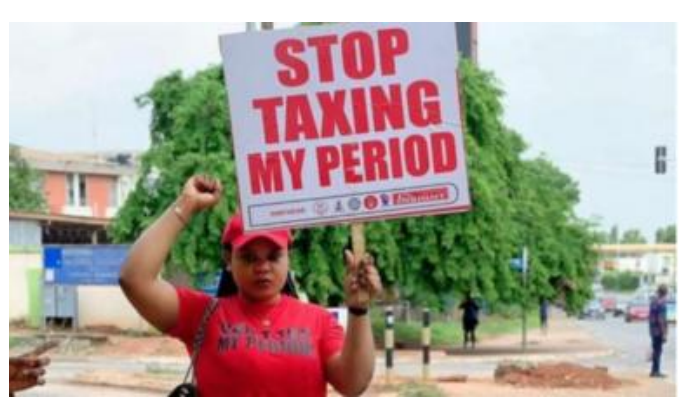
Women are being priced out of buying period products in Africa