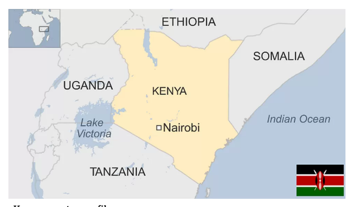
Kenya country profile