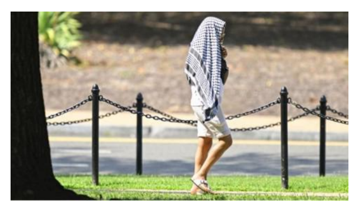
What colour should you wear in the heat?