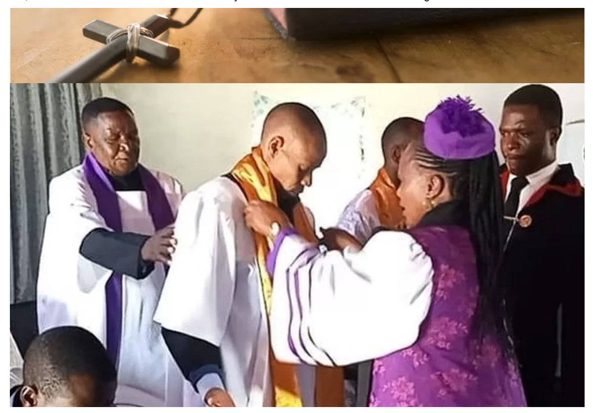
Pastor dies attempting to copy 40-day Jesus fast