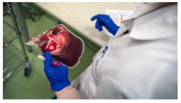
The growing promise of cord blood