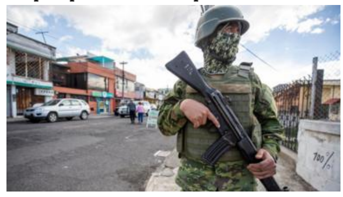
Ecuador politician murder: Prison gangs in terror reign